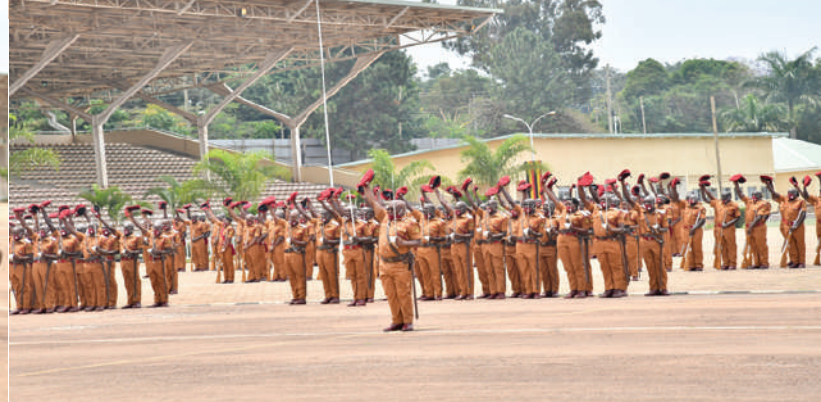
Action packed day it was at Kololo