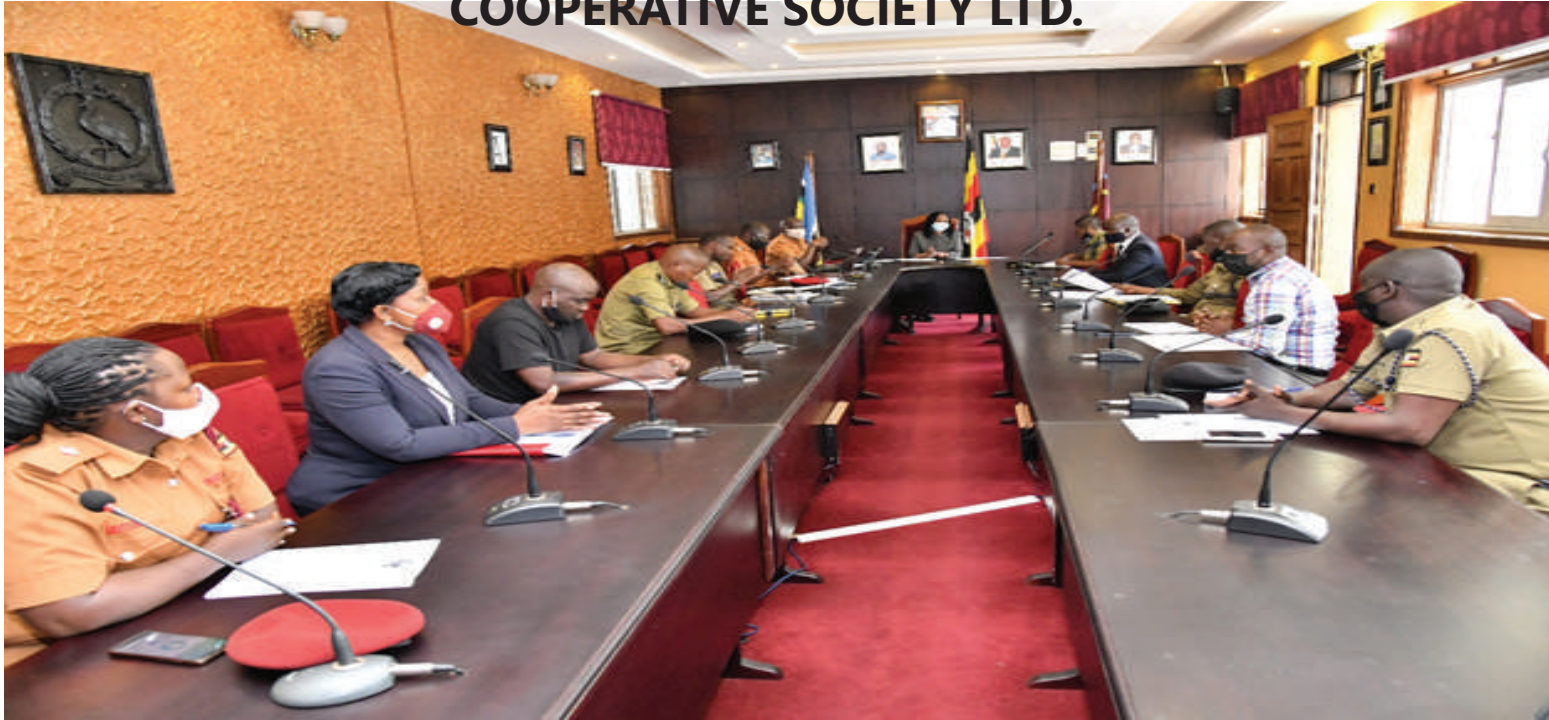
Meeting in Progress: Police Exodus SACCO and UPS SACCO

Uganda Prisons SACCO hosted a team from Uganda Police Exodus SACCO on Tuesday 24th August 2021 at the Prisons Headquarters boardroom. The benchmark meeting was well attended by Board members and management staff from the two sister SACCOS.