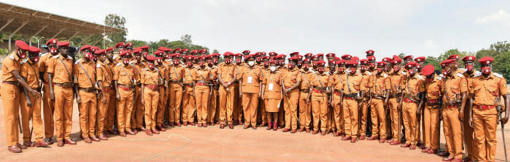
Group photo: The CASPs pose with the PATS management