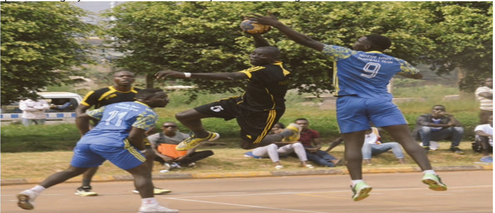
Prisons Handball star scores from close range

Prisons Handball Club is now growing far and large with a vision of becoming the best handball club in Africa embarking on a major goal of expanding the need for its commercial rights for the sport, the legacy of the club continues to prevail all over Uganda.