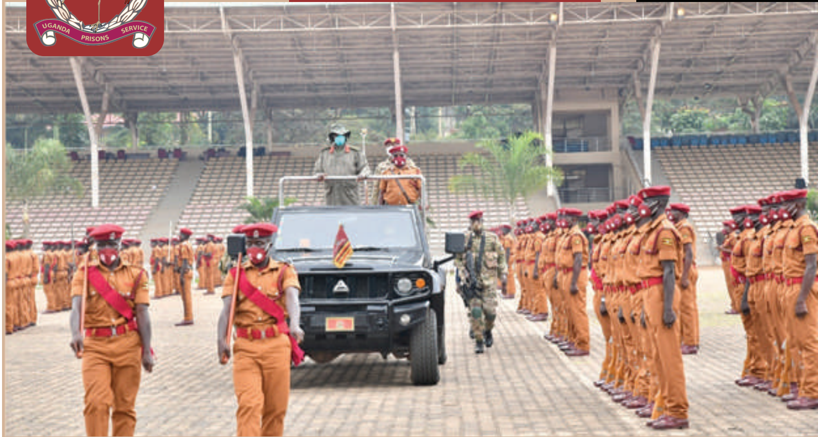
H.E THE PRESIDENT OF THE REPUBLIC OF UGANDA PASSES OUT CADET ASSISTANT SUPERINTENDENTS OF PRISONS (CASPs) AND NON-COMMISSIONED OFFICERS (NCOs) ON THE 31/08/2021.