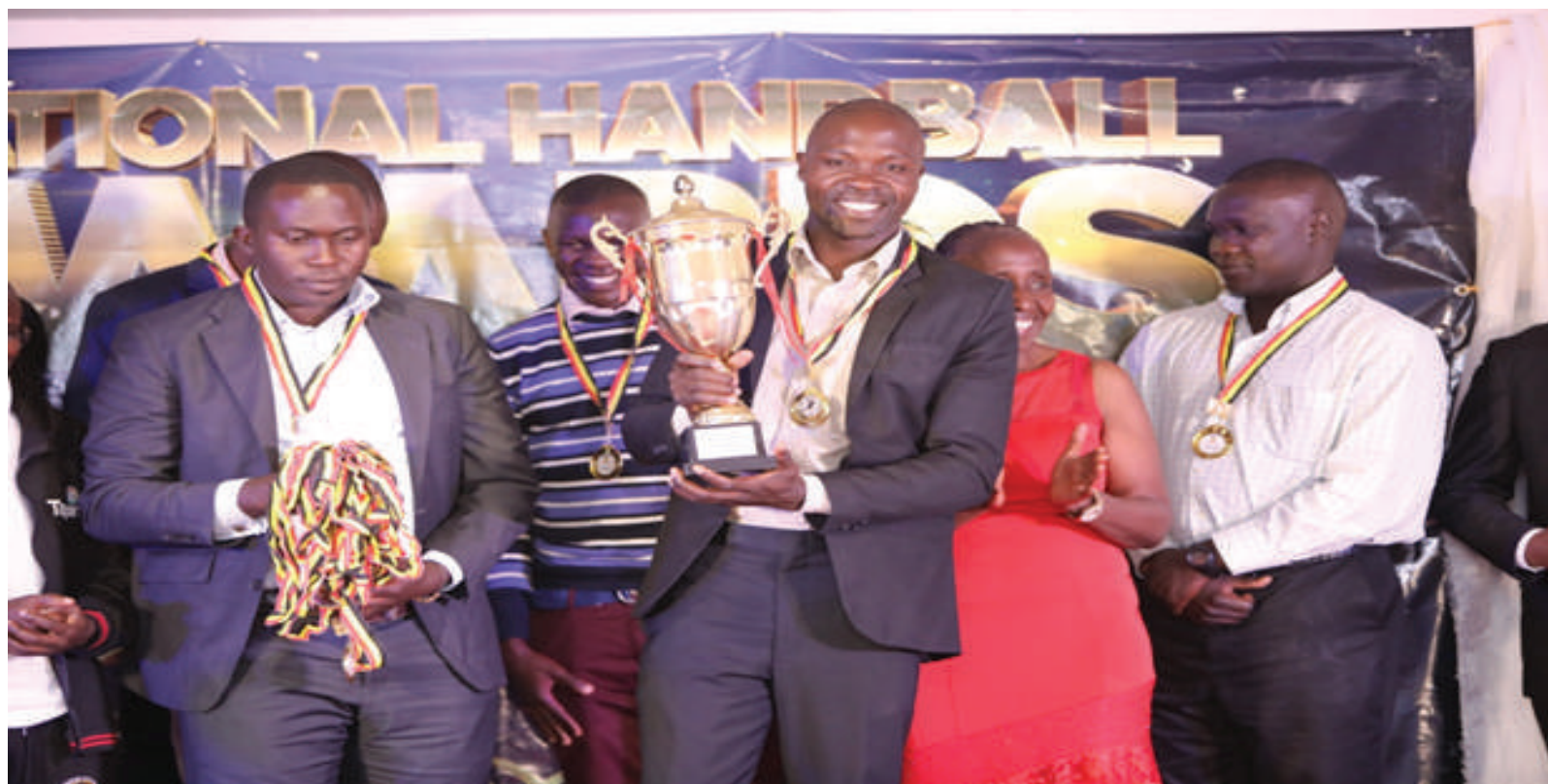
Prisons Spears being crowned champions of the National Handball League in 2019

The Club thereafter earned a massive support and enthusiasm among the Luzira community, if not Uganda at large due to it's composition of largely young talented players both of male and female age groups taken from across the board, it has over 30 players in the males' senior team, 30 players in female senior team and over 30 players in the youth feeder team (both boys and girls).