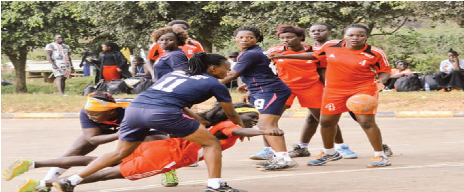
The Prisons Ladies handball team (in red) in action during the National handball