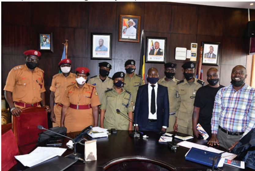
Group picture between the two institutions

The Uganda Prisons SACCO shared their best practices in the areas of operational and accounting systems, By-Laws of SACCO, AGM delegates and their tenure, Loan buy-offs, Tenure of committee members/board members as in the by-laws which provides for election of Board and SUPCO members in the Annual General meeting, Sub-committees and their tenure under supervision of the chairperson, vetting committees, compliance with regulatory requirements and share certificates.