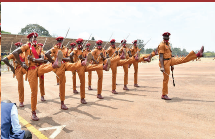
Perfection defines a professional Prisons Officer