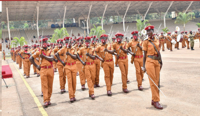
The back borne of UPS is Parade