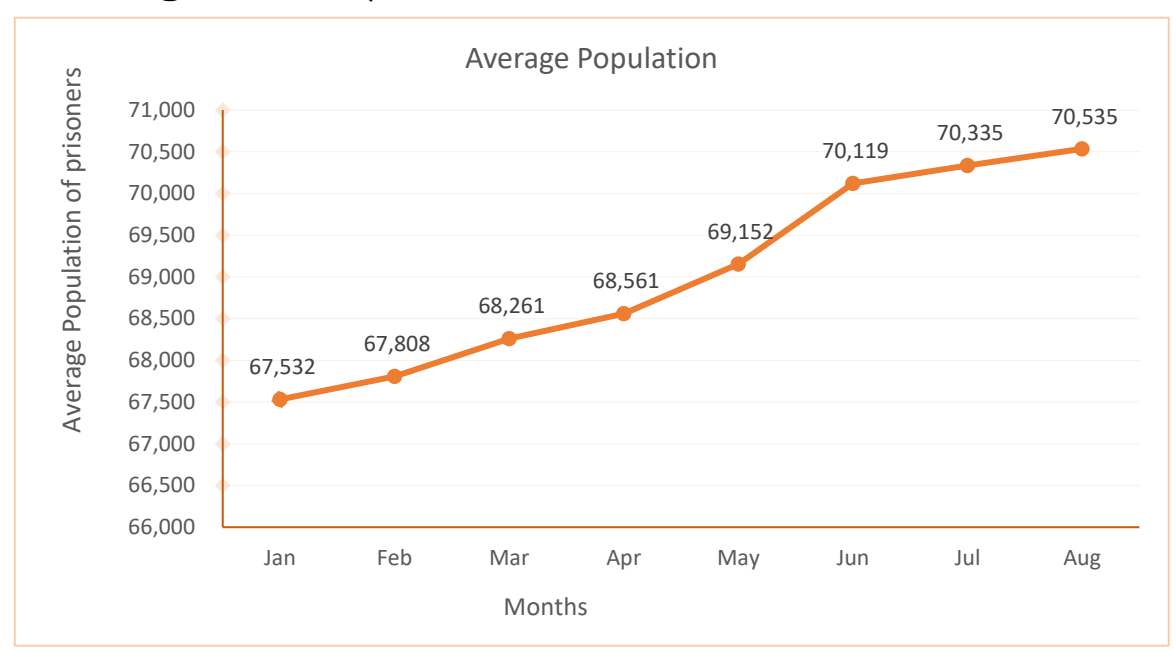
Figure 2: Trend of prisoners' population growth for the period of January - August 2022