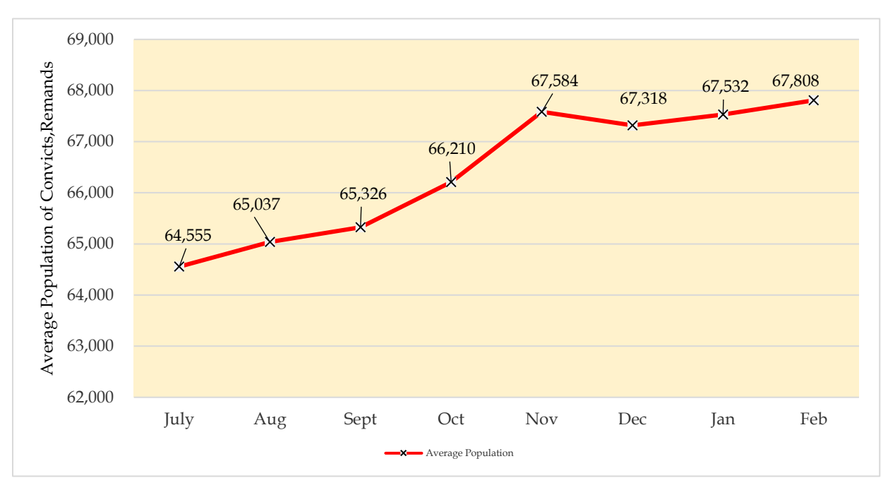
Figure 1: Monthly population Trend of prisoners